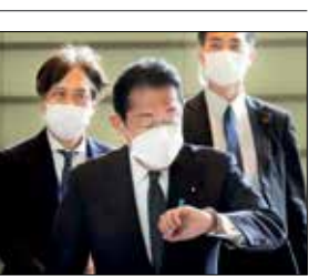
Japan's Prime Minister Fumio Kishida, center, checks his watch as he arrives to meet US Secretary of State Antony Blinken at the prime minister's official residence Monday, in Tokyo

That would allow him to work on long-term policies such as national security, his signature but still vague new capitalism economic policy, and his party's long-cherished goal to amend the U.S.-drafted postwar pacifist constitution. Advancement on changing the charter is now a realistic possibility. With the help of two opposition parties supportive of a charter change, the governing bloc now has two-thirds majority in the chamber needed to propose an amendment. The governing bloc already has secured support in the lower house. AGENCIES