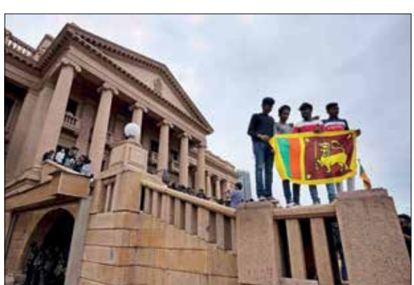
People stand holding a national flag at the President Gotabaya Rajapaksa's office on the second day after it was stormed in Colombo, Sri Lanka, Monday

It said all members of the cabinet have agreed to hand over their responsibilities to a new all-party government as soon as it is formed. "All the ministers who participated in the discussion were of the opinion that as soon as